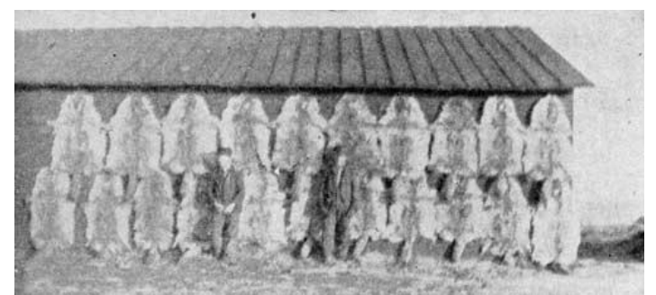
One of Wolf Trapping Photos in Book, Titled "A Good Catch"

Although Wyoming reportedly increased its wolf bounty payment to $5.00 before 1909, it remained one of the lowest wolf bounties paid by any state or province. Yet in the ten years preceding 1909, Wyoming paid State bounties of over $65,000 on wolves alone, and $160,156 on wolves, coyotes and mountain lions together,